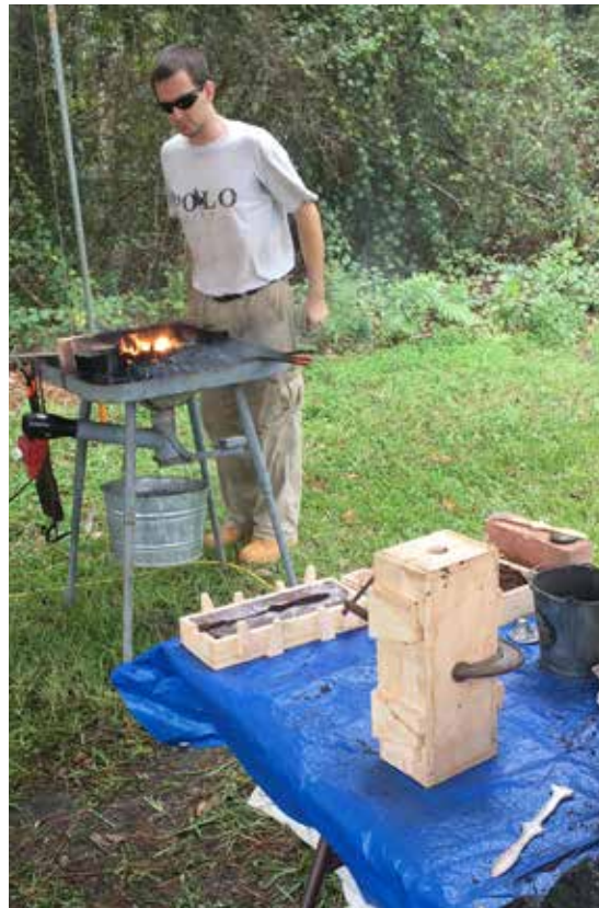
With a good melt of aluminum this time, the one flask is ready for the pour. We set the flask on the ground prior to pouring. Note that behind the vertical flask a second flask is being prepared with its sprue already cut in and one of the mini xiphos is finished and in the foreground.