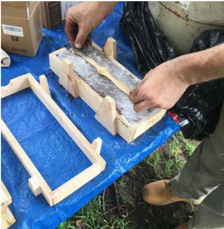
Setting the wood model into the drag. The cope is sitting next to the drag waiting to be installed.