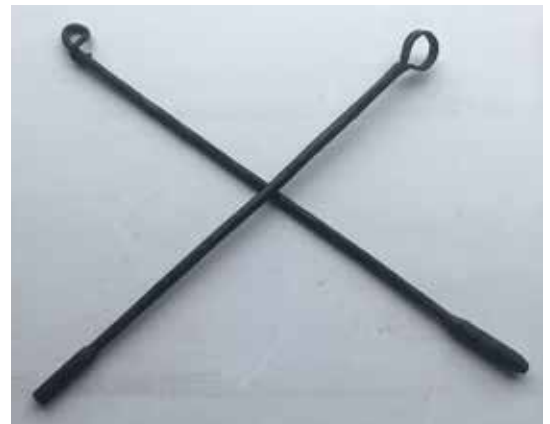
A couple of Loggerheads to draw inspiration from.

of the Timber Creek Distillery. This year's challenge will be making a loggerhead, sometimes known as a blacksmith's microwave, it's a tool for making your drink hot. Not sure how Timber Creek will judge this one, since any hot piece of metal could do the job, but it will probably need to look good enough that you'd be willing to put it in a tankard that you intend to imbibe from. The power hammer will be available for use during this event.