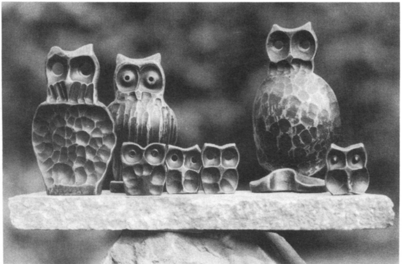
The Owl's Family