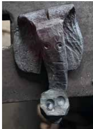
The Southwest Region made a herd of elephants during their February meeting. Page 4